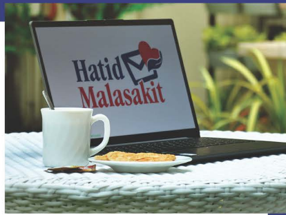
Coffee Friday is a part of the Hatid Malasakit campaign of the Post Office.