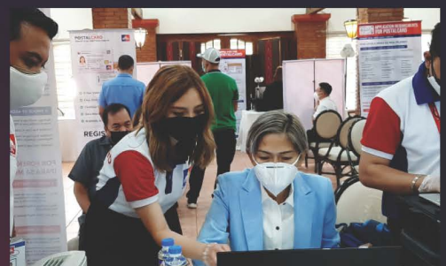
The Post Office's Postal Card joins the One-Stop Shop Caravan of Malacañang Palace for their employees last May 30-31, 2022 and June 21-22, 2022.