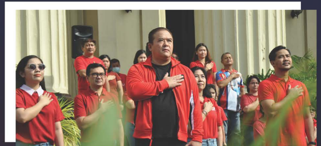
The new Post Office institutional videos were shot on location at the Manila Central Post Office Building and at the Central Mail Exchange Center in Pasay City.

To promote its Hatid Malasakit campaign across all post offices nationwide, the Manila Central Post Office (MCPO) and Central Office (CO) under the Office of the Postmaster General initiated the launch of its new institutional video, featuring the reforms and changes that have been effected with the assumption to office of Postmaster General and CEO Norman N. Fulgencio. Along with this, a Lupang Hinirang video showcasing the hardworking postal employees of MCPO was produced.